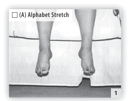
Duangle your reet over the side of the bed making sure they do not touch the floor.