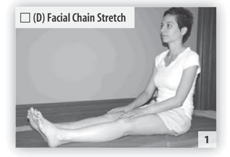
Sit with your legs out-stretched in front of you.