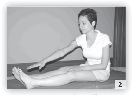
Reach for the toes of the affected foot with the opposite hand.