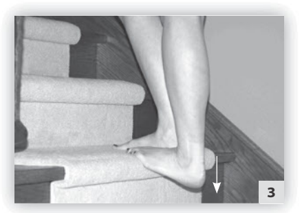
Keep your knee straight while holding the stretch for 20 seconds, rest for 5 seconds and repeat five times on each foot. This exercise should be completed twice daily.