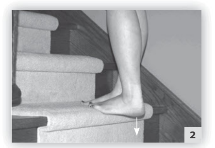
Lower the affected heel below the level of the stair until you feel a stretch.