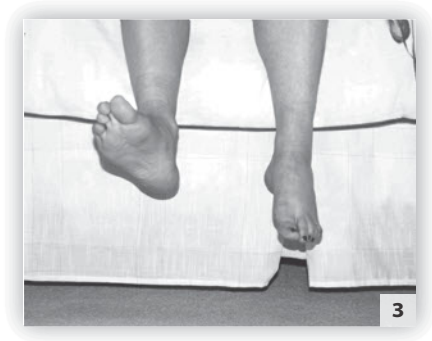
Repeat on each foot.