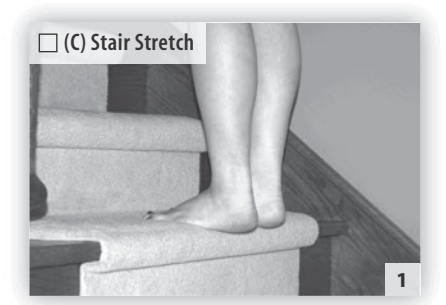
Stand with both feet on the same stair.