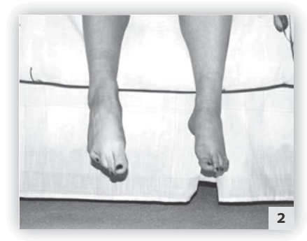
Imagining your big toe to be a pen, slowly write the alphabet from A to Z in the air.